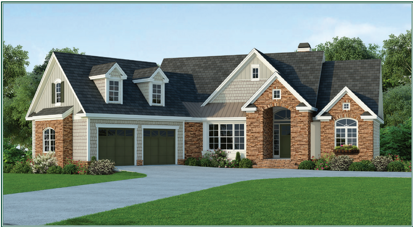
© 2008 Donald A. Gardner Architects, Inc.