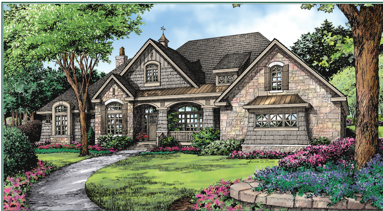
© 2007 Donald A. Gardner Architects, Inc.

This Arts and Crafts styled sprawling ranch house plan has so much to offer the modern homeowner. A three car garage with extra storage adds space for a third automobile, workshop, or golf cart. Inside, each bedroom of this house plan features elegant ceiling treatments, a walk-in closet and an adjacent full bathroom. A large utility room with a sink is conveniently placed down the hall from the secondary bedrooms. The large, gourmet kitchen of this house plan includes a walk-in pantry and a large central island. The spacious dining room offers large windows and a buffet nook for furniture. Custom-style details abound in this luxurious plan with built-ins in the great room and breakfast areas. This house plan's well-appointed master suite includes a secluded sitting room that enjoys rear views, porch access and dual walk-in closets. The master bathroom is a spa-like retreat with dual vanities, a large walk-in shower, built-ins and a vaulted ceiling.